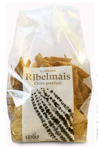
LÜTOLF AG, St. Margrethen