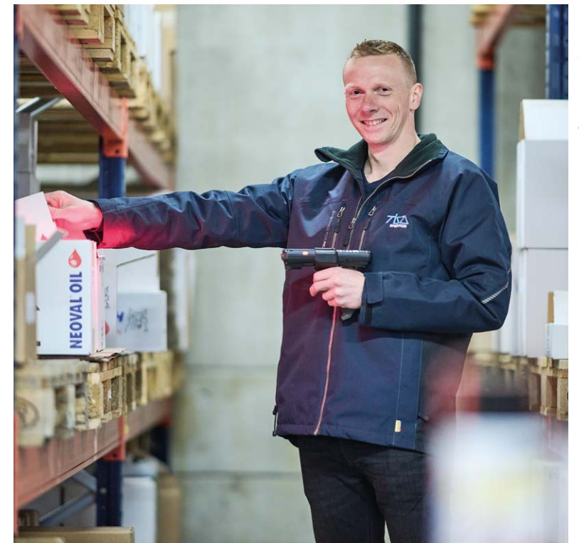
Remannéa tgeakmees nct are of our supply chain