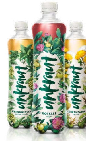
NAPURE AG, Mumpf